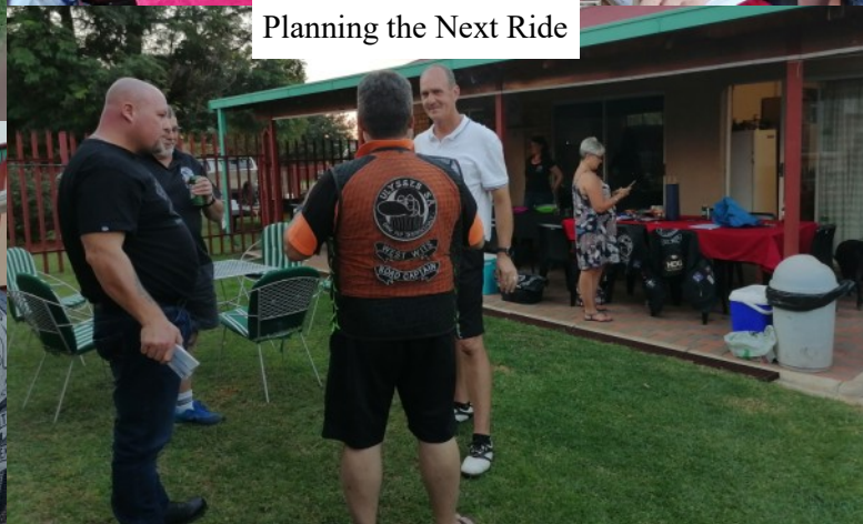
Planning the Next Ride