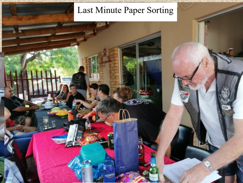
Planning the Next Ride