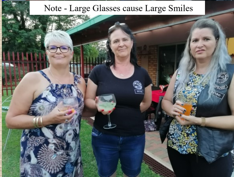
Note - Large Glasses cause Large Smiles