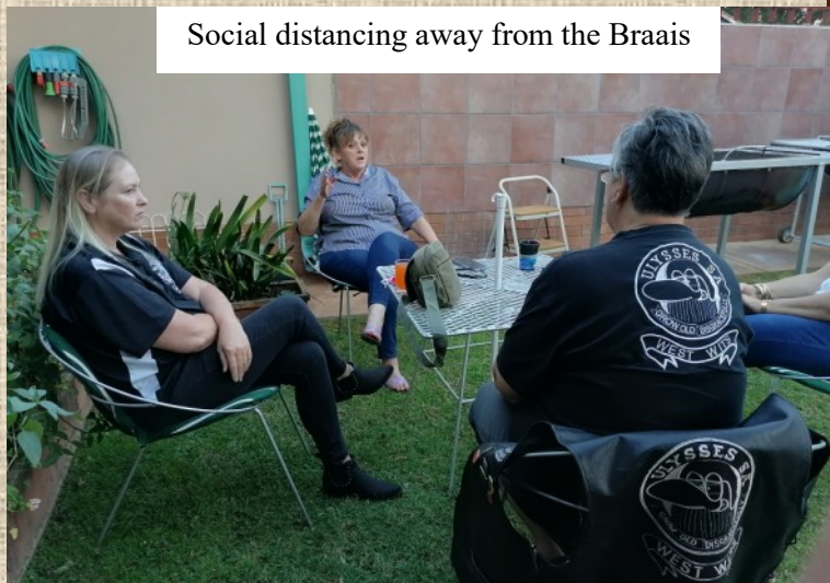
Social distancing away from the Braais